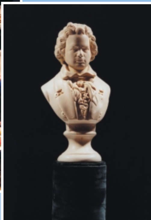
Protecting Single Items