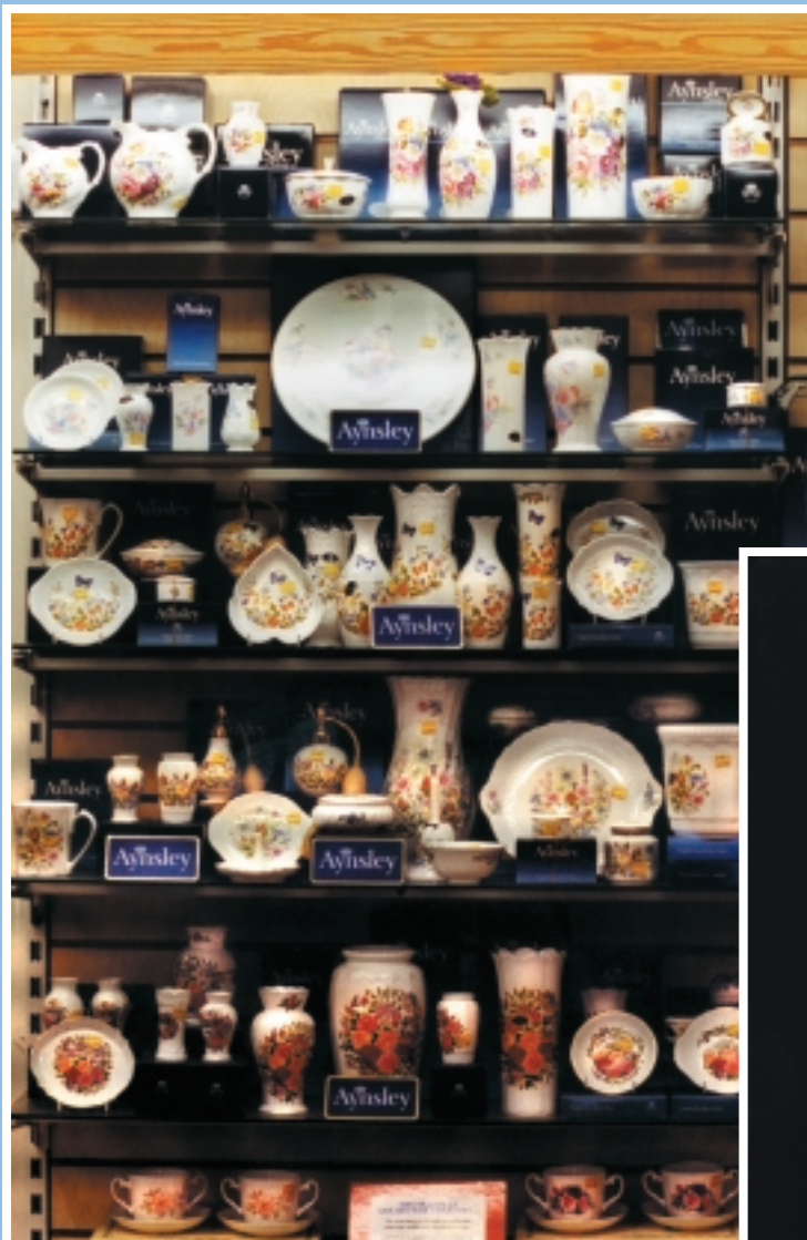
Protecting Multiple Items

A winner of the Design Council's Millennium Products award for innovation